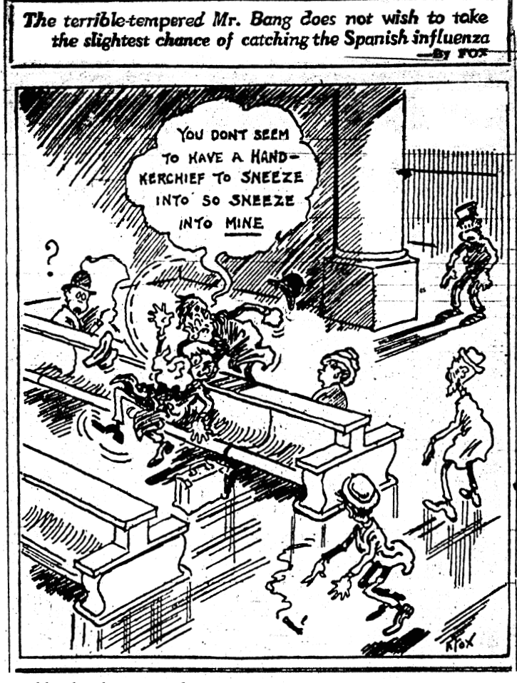
Oakland Tribune, October 12, 1918.

With its "main arteries" engorged with patriotic sentiment and activity, still the pulse of campus life beat steadily on. The Daily Californian notes, "we have successfully held our customary Freshman Rally, the classes have met and organized, and we have a football team training in the field." Yet even as American soldiers went over the top to face the certainty of German fire in Europe, men and women on the home front would come to fear an invisible enemy, one as likely to arrive on the breath of a friendly "hello," or the lips of the next lover's kiss, as to mingle anonymously in crowded classrooms, lecture halls and theaters. A microscopic virus would affect the University in a way that a world war could not. The most serious influenza