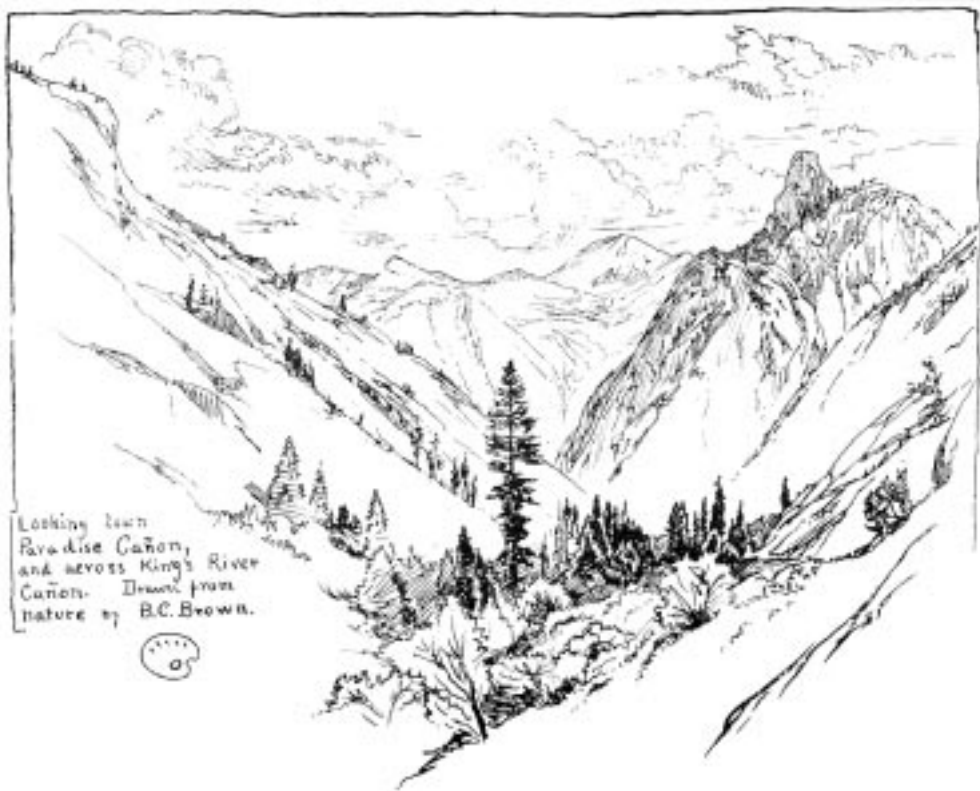
Sierra Club Bulletin , January 1898.