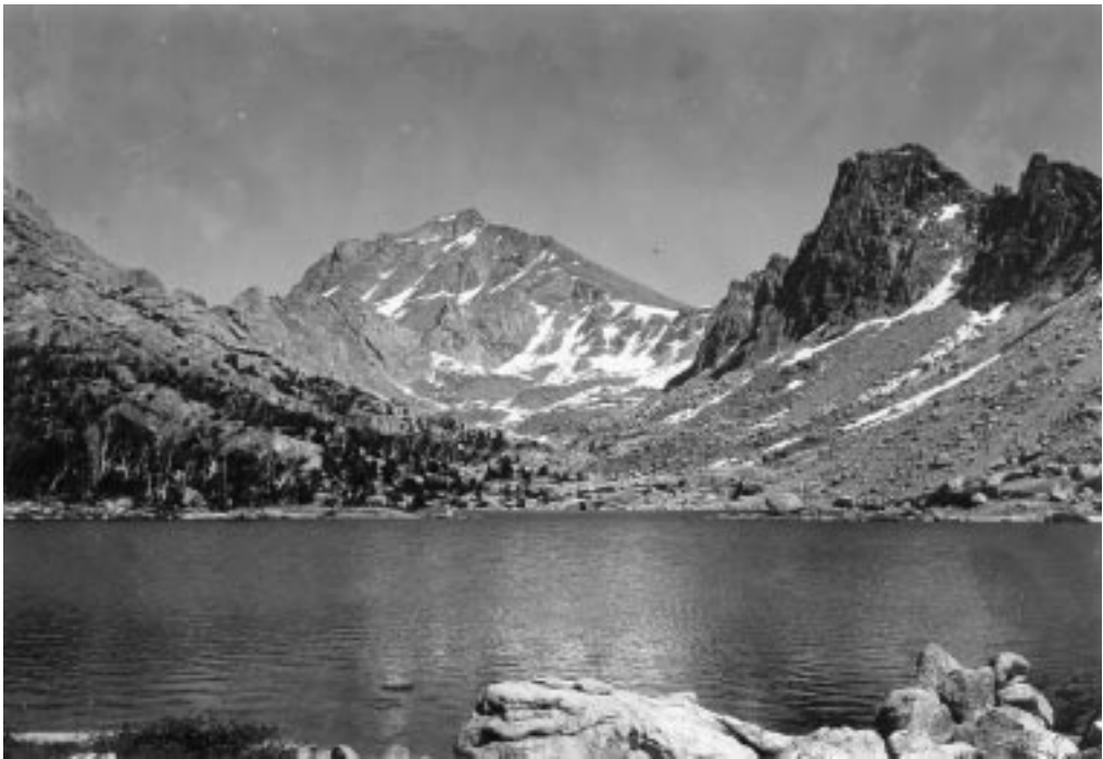
University Peak, circa 1899.

Joseph N. LeConte was the son of professor of geology Joseph LeConte, whose 1870 trip with the “University Excursion Party” to the Yosemite region and meeting with John Muir is recounted elsewhere in this issue. 1 “Little Joe,” as he was known, had made family trips to Yosemite as a boy and in 1889 accompanied his father and his students on a trip